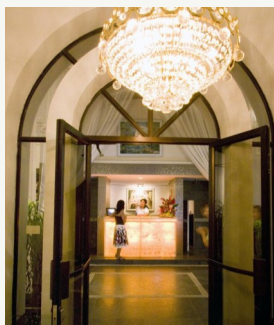
NEW AND IMPROVED LOBBY AND BREAKFAST AREA WITH AN EXQUISITELY LIT ONYX RECEPTION DESK

December 8th, 2010 marked the 10 year Anniversary for La Mansion Inn! To commemorate this milestone event in conjunction with the Grand Opening of their newly remodeled Lobby,